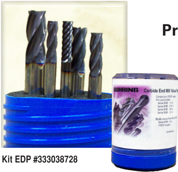
Kit EDP #333038728

PLUS - a bonus: One Series 3179 Finish-Tech 50 1/4" dia.